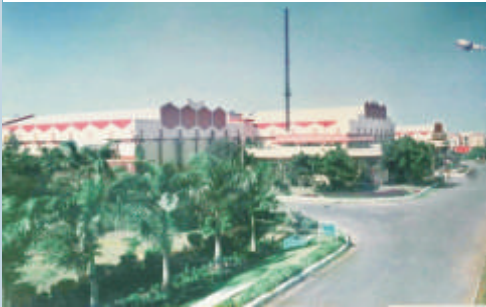
SPENTEX INDUSTRIES LTD.-PITHAMPUR