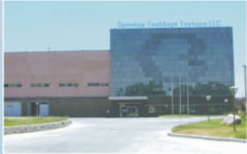
SPENTEX TASHKENT TOYTEPA LLC-TASHKENT