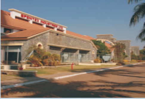
SPENTEX INDUSTRIES LTD.-BARAMATI