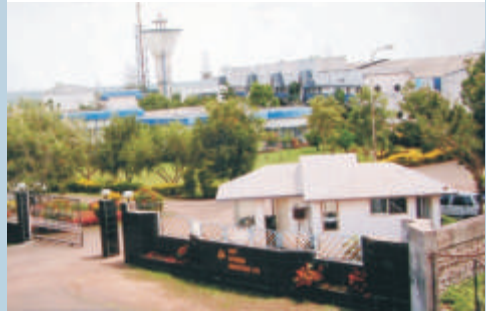
AMIT SPINNING INDUSTRIES LTD.-KOLHAPUR