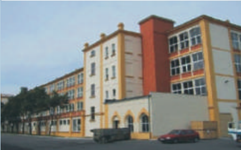
SPENTEX INDUSTRIES LTD. - CZECH REPUBLIC