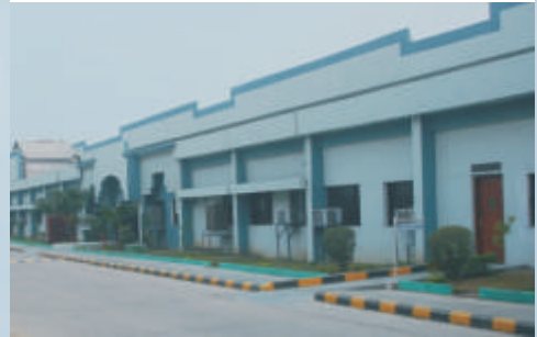
SPENTEX INDUSTRIES LTD.-BUTIBORI