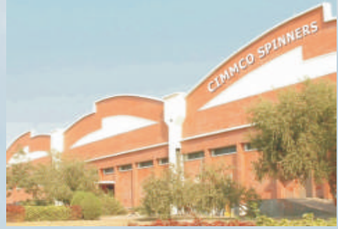
CIMMCO SPINNERS. SOLAPUR